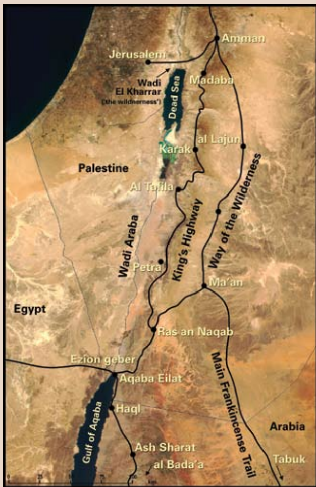
East of Jerusalem in Lehi's time were two established routes southward, with a branch leading to Ezion-geber on the Gulf of Aqaba, an arm of the Red Sea.

There would seem to be a historical precedent for the family escaping to the east toward the Way of the Wilderness and the King's Highway. That was the preferred exit route from Jerusalem not only for those Israelites who fled when Nebuchadnezzar captured Jerusalem in 587 BC 18 but also for King Zedekiah and his family. 19 It would seem that if Lehi took the same route taken by most others who escaped from Jerusalem shortly after Lehi's departure, then it would be perfectly correct to describe that course of travel as departing "into the [Way of the Wilderness]."