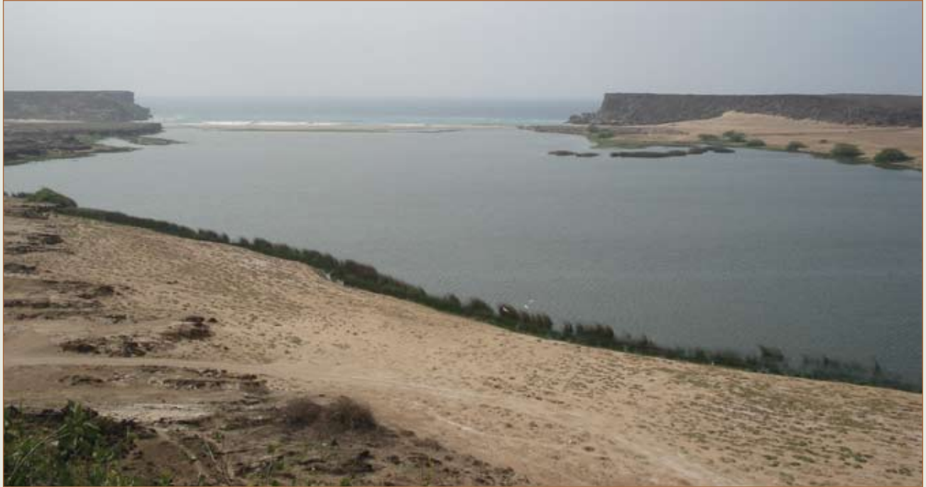
Its natural breakwaters affording year-round protection from monsoon winds and surf, Khor Rori was the premier port on the Dhofar coast of Oman in ancient times.

monsoon winds. Thus the port could be used all year for shipping and shipbuilding.