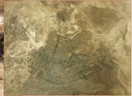
Below: Ancient rock art in caves near Khor Rori portrays ships.

Because Khor Kharfot (Wadi Sayq) has been suggested as the location of Nephi's harbor, 111 we discuss it briefly here. It is an isolated inlet 66 miles west of Salalah, a 70-mile journey over mountains from the ancient port where Nephi could have found shipbuilding timber, cotton, rope fiber, and other necessary resources. Nephi would have needed to haul all of these heavy imported goods to Khor Kharfot in order to build his ship. Khor Kharfot is presently closed off by a sandbar. There is no documented evidence that the inlet was open to the sea in Nephi's time, but if it were, the inlet is very narrow and the floor is strewn with huge boulders that would have posed considerable risk to anything other than small, shallow-draft vessels attempting to use it. For these reasons, and others, we do not consider it a candidate for Bountiful.