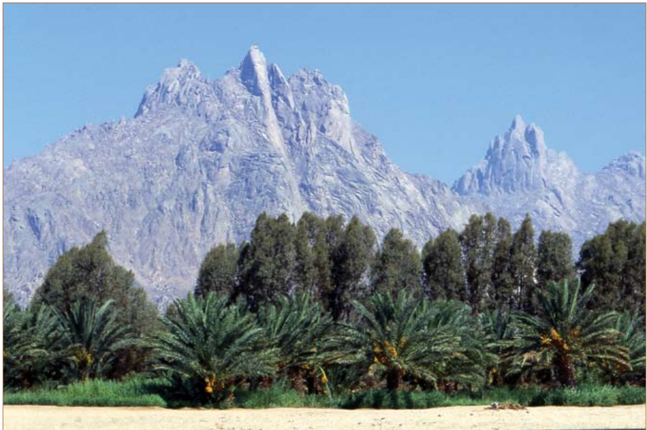
Wadi Agharr, the authors’ candidate for Nephi’s Shazer, is an extensive oasis valley near both the Red Sea and the Gaza branch of the Frankincense Trail.

Nephi informs us that after leaving Shazer, the party traveled “in the most fertile parts of the wilderness” (1 Nephi 16:14), yet the famous explorer Richard Burton described the Hijaz in these words: