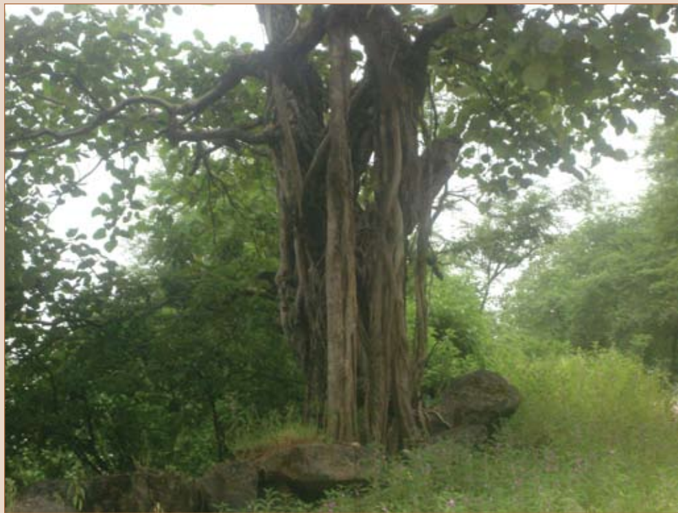
Omani shipwrights used imported teak instead of gnarly softwoods like these large fig trees that grow in Dhofar's hills.

Authors who have written about the time Lehi spent in Bountiful have invariably glossed over the details regarding the building of Nephi's ship, 71 and yet the building of the ship was an enormous undertaking that spanned many years and required massive quantities of very specific natural resources. Nephi's voyage to the New World would have taken many months, if not years, and any feasible route