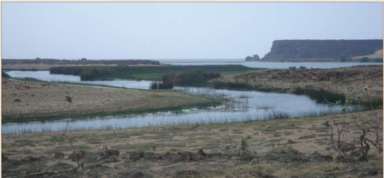
Freshwater stream at Khor Rori.

From time immemorial, large hulls have been launched from harbors, and Nephi's narrative implies that his ship was no exception. The coastline of Dhofar is known for its heavy surf and consists of rocky cliffs alternating with sandy beaches. Launching a ship weighing as much as 100 tons (and having no means of power or control) from a shallow beach into breaking surf with strong currents is physically impossible and would only result in a shipwreck. Yet Nephi's text implies a calm, orderly, and seemingly routine embarkation in which party members all boarded the ship before they "did put forth into