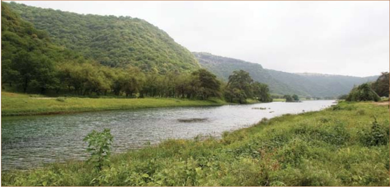
Lake at Wadi Darbat, a large valley a few miles above Khor Rori, is exceptional for its large trees, abundant vegetation, and wildlife.

only if he was at an established port. The strength of Khor Rori over other locations proposed for Bountiful is that it is the only established large port in Dhofar in Nephi's time. One does not need to rely on a long list of miracles in order to artificially make this location fit the necessary requirements essential for building, launching, and sailing a large ship. No location other than Khor Rori has yet been able to meet these criteria.