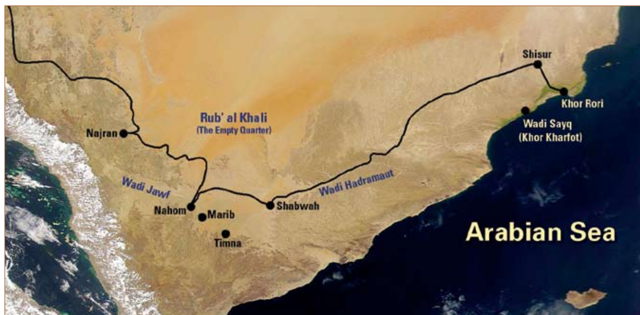
Recent research indicates that an overland trail ran eastward from Shabwah to the frankincense groves in southern Oman. Shown here is the authors’ conjectured route for Lehi’s trail, with the eastward leg from Wadi Naham leading through Wadi Hadramaut to Shisur and thence to the ancient seaport of Khor Rori. See map on page 77.

Nephi relates that after Nahom the family traveled “nearly eastward from that time forth” (1 Nephi 17:1). Here again the Book of Mormon narrative is in total harmony with the route of the Frankincense Trail in 600 BC. The main trail ran through the capitals of the incense kingdoms of Ma’in, Saba, Qataban, and Hadramaut and ended at the port of Cana. This route followed the easiest terrain through protected valleys and the areas of greatest population concentration. The downside to this trail was that all of these kingdoms extracted a levy from the caravans as they passed. Pliny recounts that the caravan route from southern Arabia to Gaza was enormously expensive. 44 In order to reduce the journey’s duration between these “state capitals” and to avoid the levies that would be applied, a number of shortcuts or secondary trails came into existence. Though cheaper to travel on,