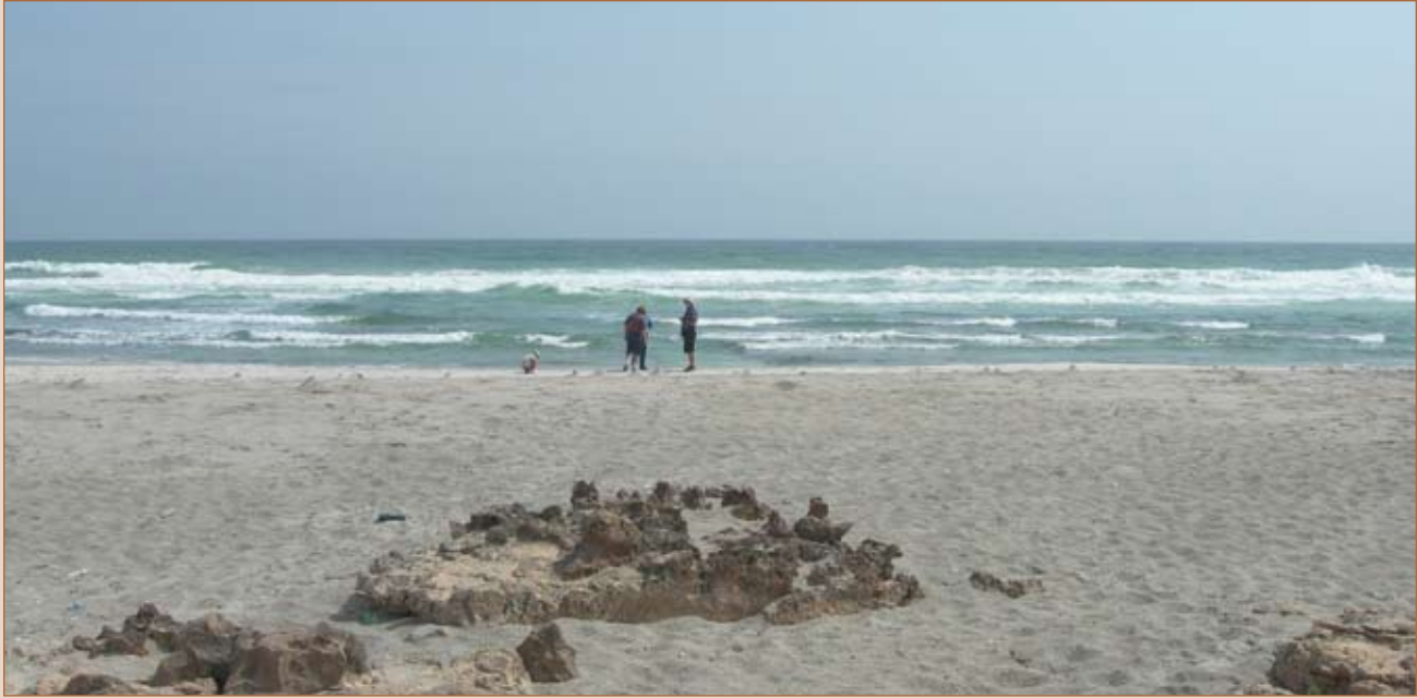
Breaking surf at Salalah. Building and launching a relatively large vessel like Nephi's likely required a protected harbor to avoid the perils of beach launching into the typically rough surf and strong currents of the Dhofar coast.

the sea” (1 Nephi 18:8). There is only one way that everyone could be on board the ship and then “put forth into the sea”—the ship had to be moored in a deep, calm harbor. Nephi does not describe the family pushing the ship into the sea; they are already on board.