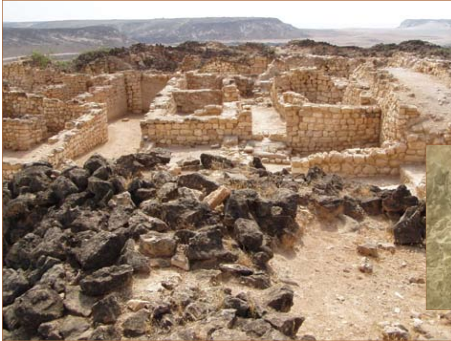
Left: Sumhuram ruins at Khor Rori. Sumhuram was a fortified port that controlled incense trade.